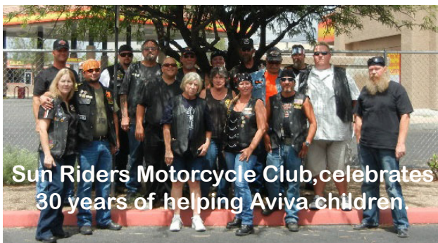
Sun Riders Motorcycle Club celebrates 30 years of helping Aviva children.

...and we need you to help us. Aviva coordinates several projects to help children in Child Protective Services have as good a Christmas as possible. The following is a brief description of each. Please feel free to contact Aviva's office at 327-6779 for more information.