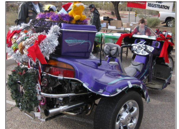
Participants decorate their bikes for the Toy Parade pictured above and below is the start of parade with all the bikes lined up..

To register for the Parade go to: www.tucsonsunridersmc.com . To sign up to volunteer to help with the Parade, or to wrap the toys the following week, or to purchase raffle tickets go to: www.avivatucson.org . We also invite you and your family to stand along the route to wave to the motorcycle riders and thank them for their dedication. The parade route will be posted on Aviva's website.